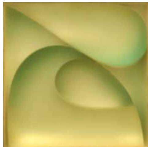
Detour 12x12 aluminum, silk