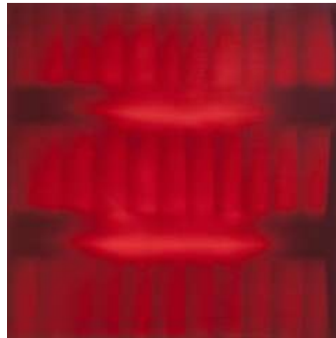
Full Scale 20x20 aluminum, silk